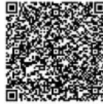
Director ATAL Academies