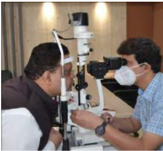
Photograph 4: Eye Health camp