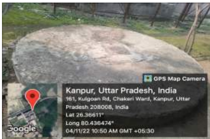
Photograph 8: Rain water harvesting unit in campus