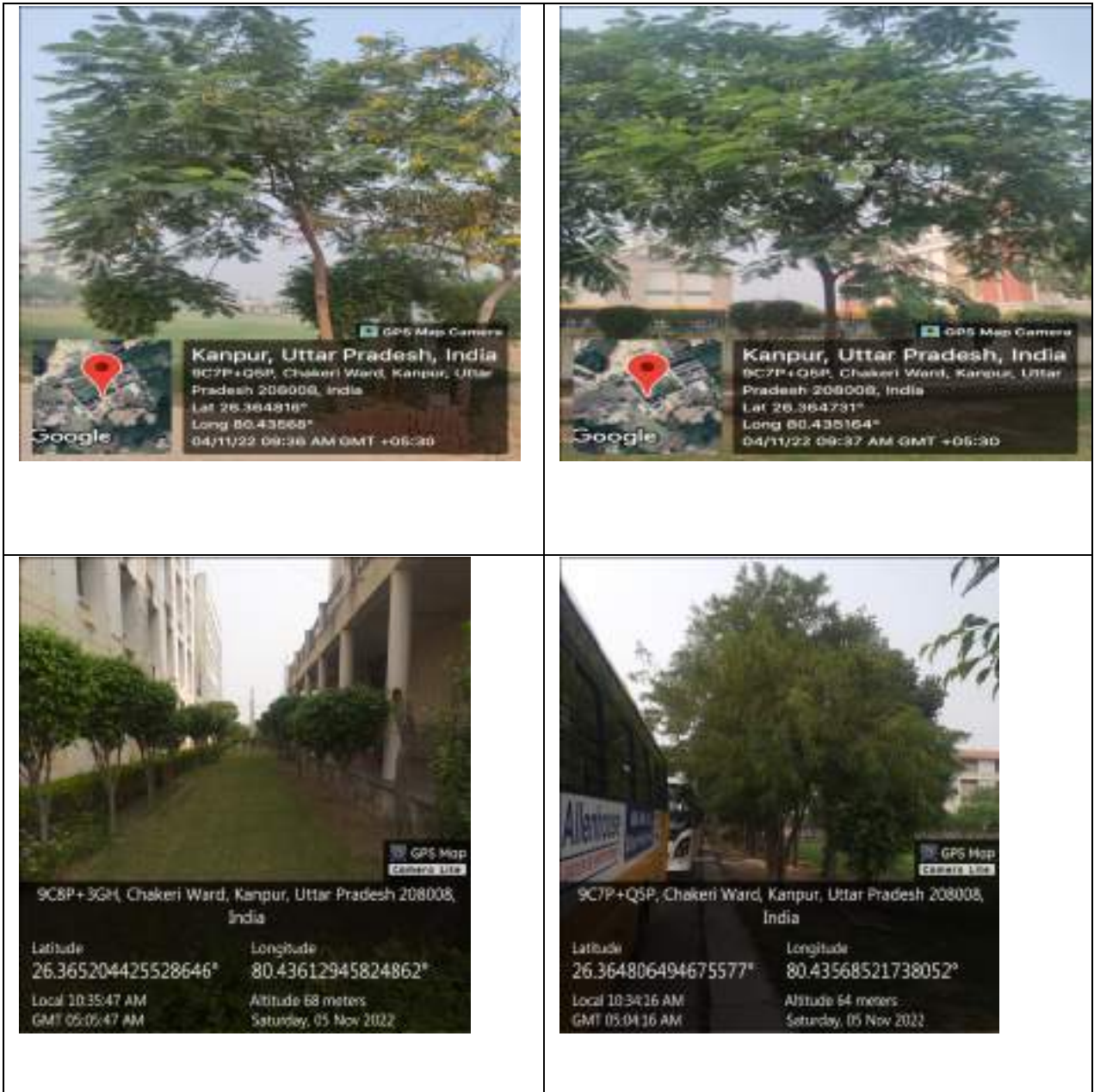
Photographs 1. Tree's diversity in college campus