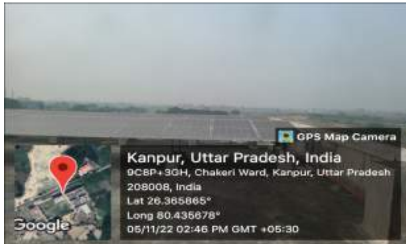
Photograph 7: Solar Panel set up for clear energy