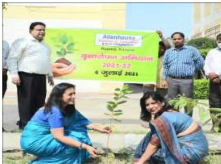
Photograph 3: Plantation activity at college campus.