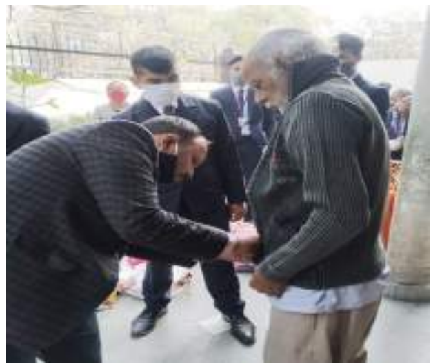
Photograph 5 : Health check-up of villagers