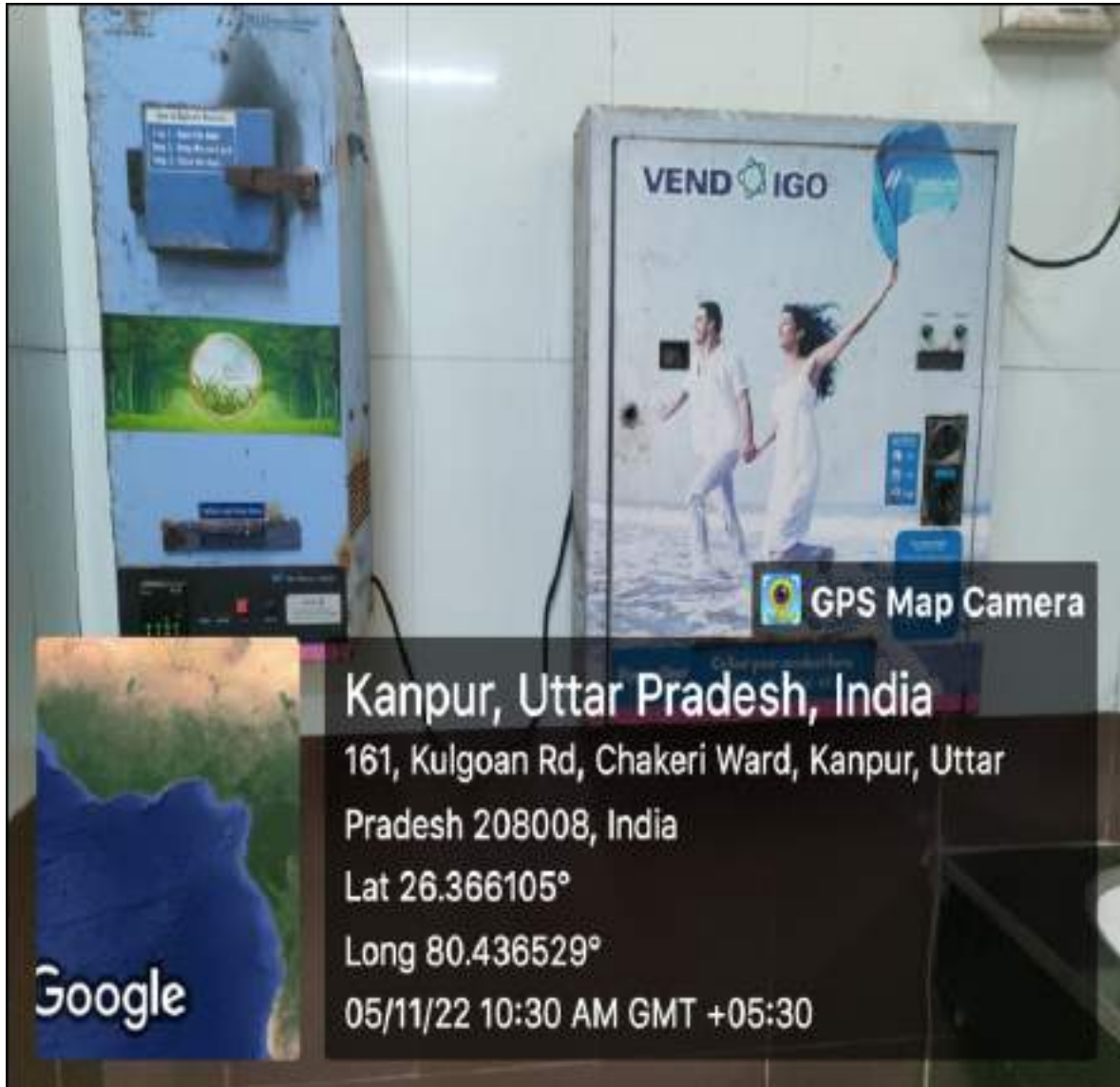
Photograph 2 : Women Sanitary Incinerator in block A of campus