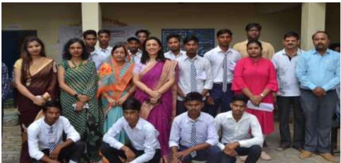
Photograph 6: Women health awareness camp organized by Allenhouse Institute of Technology on World Population day