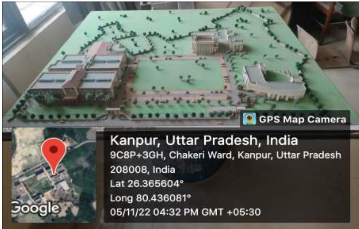
Fig 2. Layout of Allenhouse Institute of Technology